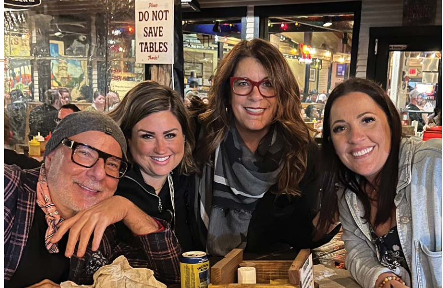
The Marcia Selden Catering & Events team makes a point of bonding together with other speakers during Catersource + The Special Event.

One of my favorite reasons to take our team to CS+TSE is that it's full of team building! It's not just about sitting through sessions—it's about bonding with your teammates over