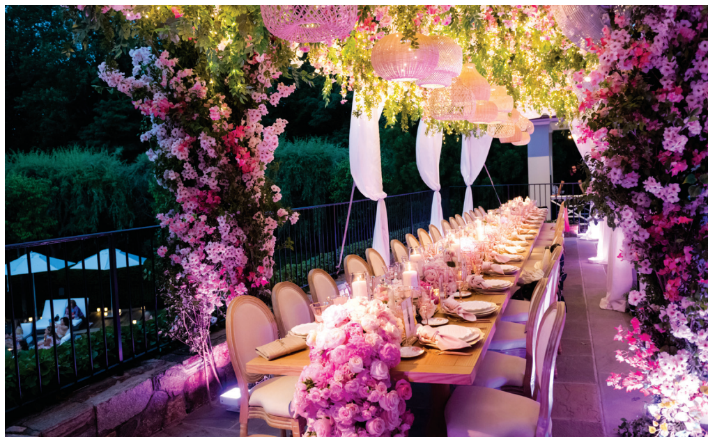
above: An astonishing and definitely once-in-a-lifetime celebration dream designed by Marcia Selden Catering & Events. This one, lush with flowers, included a surprise performance by Cyndi Lauper below: Zucchini ribbons and soup like you've never seen