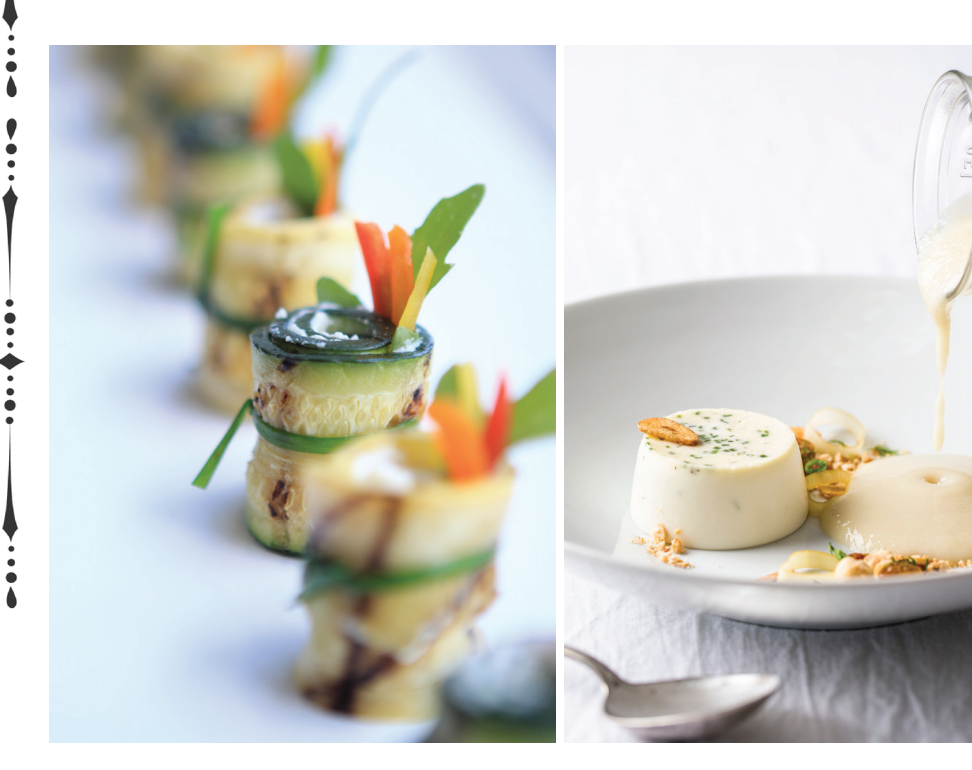
JULY/AUGUST 2023 GREENWICH 69

Call it creative. Call it dramatic. Call it romantic. Just don't forget to include calling it absolutely delicious. When Marcia Selden is given her full power of expression, her catering is a many splendored feast for the senses. Everything looks beautiful. Feels luxurious. Smells like a hint of heaven. Tastes like bliss. Sounds like one of the best events of one's life, right? The events have a way of exceeding every expection, yet remaining on point; that is, if it's over the top, it's somehow not too much. The party is permission to escape the every day. Gathered with your nearest and dearest or hosting an event to make a big impression, you can trust that Marcia Selden and her talented team will roll up their sleeves and bring the magic. The number of votes for Best Of suggest our readers don't want to see behind-the-scenes to understand how she does it. They just want to enjoy the performance.