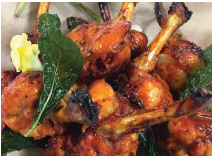
Tandoori-style beer-braised chicken drumettes, served with a sauce made of honey, soy sauce, lager, and tandoori spice, by Wolfgang Puck Catering (404.581.4126, wolfgangpuck.com ) at the Georgia Aquarium in Atlanta