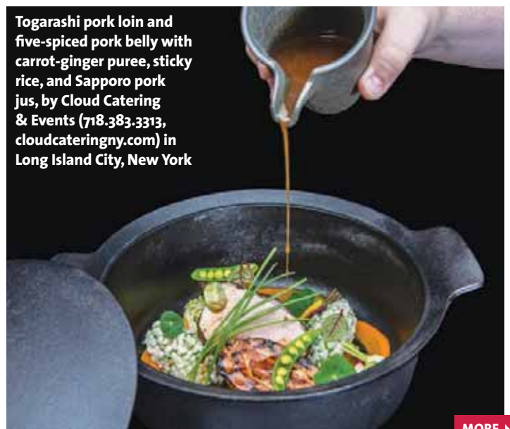
Togarashi pork loin and five-spiced pork belly with carrot-ginger puree, sticky rice, and Sapporo pork jus, by Cloud Catering & Events (718.383.3313, cloudcateringny.com ) in Long Island City, New York