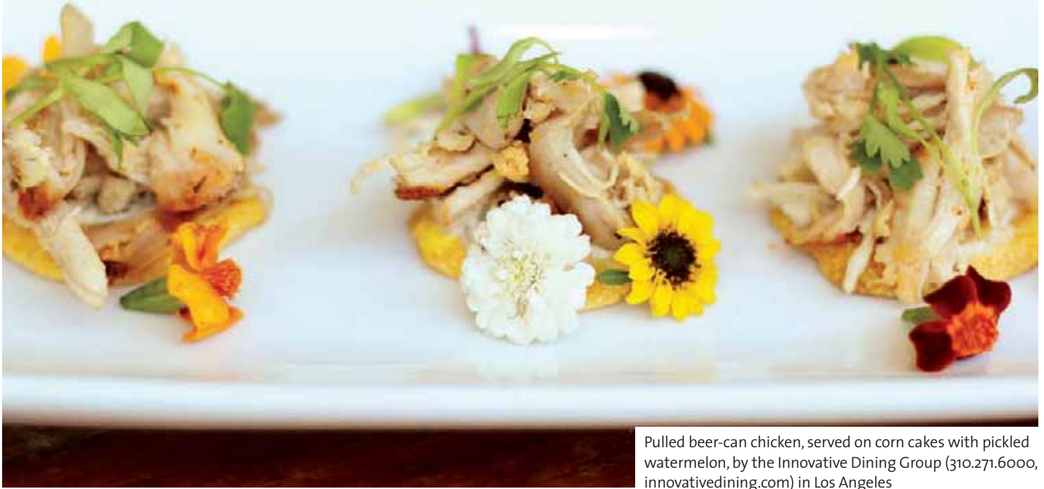
Pulled beer-can chicken, served on corn cakes with pickled watermelon, by the Innovative Dining Group (310.271.6000, innovativedining.com ) in Los Angeles