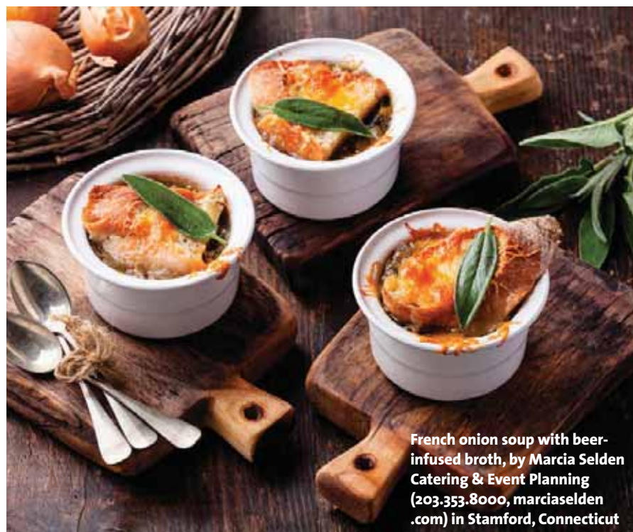
French onion soup with beer-infused broth, by Marcia Selden Catering & Event Planning (203.353.8000, marciaselden.com) in Stamford, Connecticut