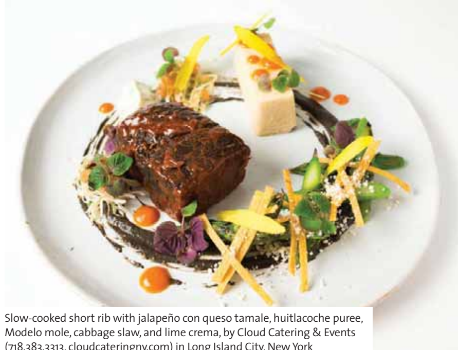
Slow-cooked short rib with jalapeño con queso tamale, huitlacoche puree, Modelo mole, cabbage slaw, and lime crema, by Cloud Catering & Events (718.383.3313, cloudcateringny.com) in Long Island City, New York