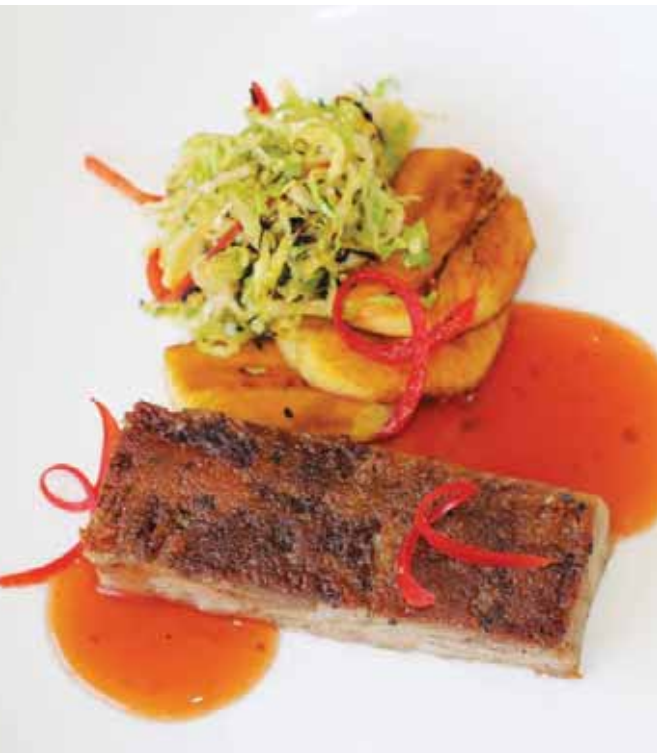
Beer-braised pork shoulder, served with fried tostones, sprout salad, and a peach-I.P.A. sauce, by Brix Catering & Events (312.259.2776, brixcatering.com) in Chicago