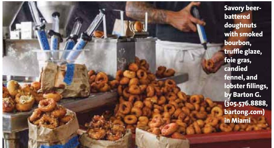
Savory beer-battered doughnuts with smoked bourbon, truffle glaze, foie gras, candied fennel, and lobster fillings, by Barton G. (305.576.8888, bartong.com ) in Miami