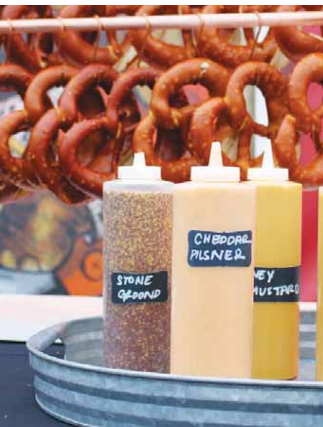
Traditional baked pretzels served with a cheddar-pilsner sauce, by Patina Catering (866.972.8462, patinagroup.com) in Los Angeles