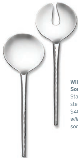
Williams-Sonoma Stainless steel servers; $40 for set. williams-sonoma.com

Presentation is key, so dole out your dishes in style. Having serveware in multiple finishes will come in handy as your menu changes.