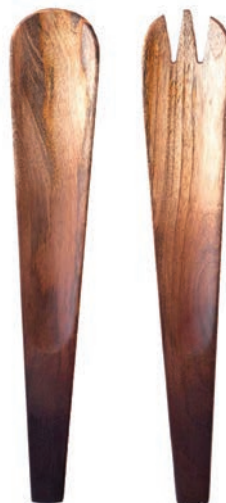
Dot & Bo Sunset mango salad servers; $28 for set. dotandbo.com