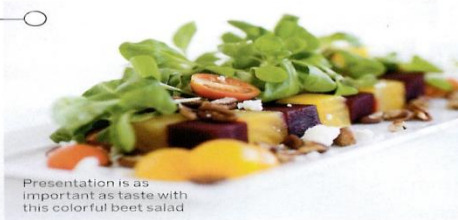
Presentation is as important as taste with this colorful beet salad